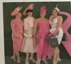
Best Headwear & Best dressed