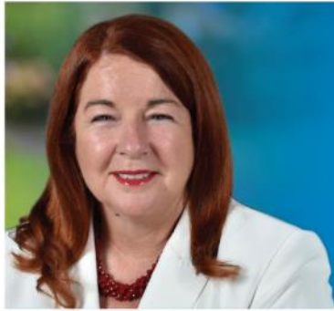
MELISSA PRICE MP Federal Member for Durack