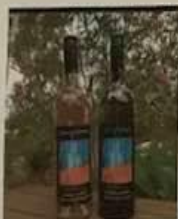
Stringy bark Wineries