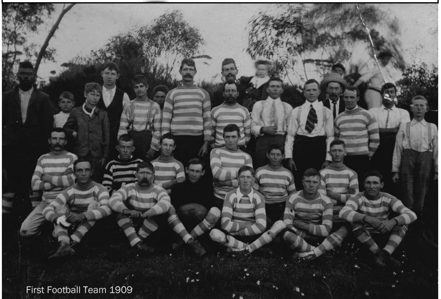
First Football Team 1909