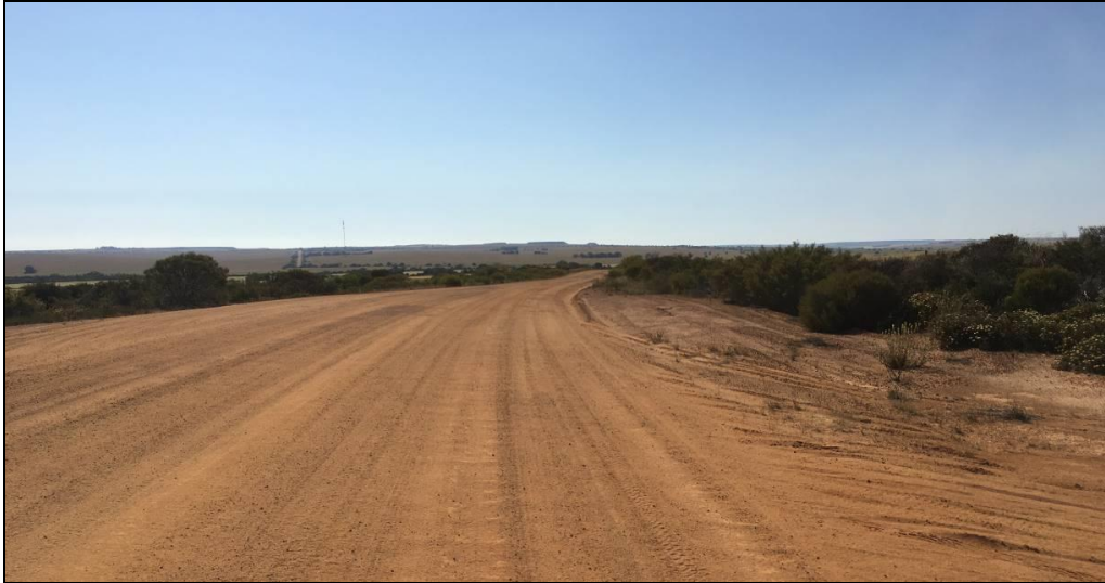
Figure 9.1.1(g) – View of Extractive Industry from eastern access point