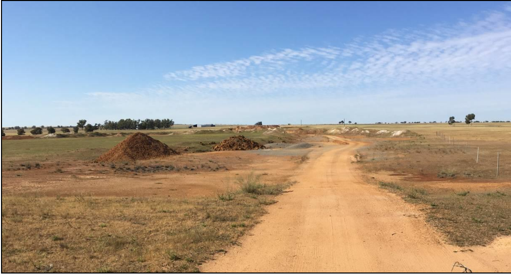
Figure 9.1.1(e) – View facing west along Skipper Road from western access point