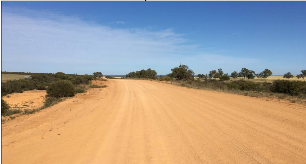
Figure 9.1.1(f) – View facing east along Skipper Road from western access point