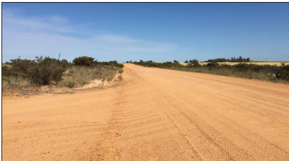
Figure 9.1.1(i) – View facing east along Skipper Road from eastern access point