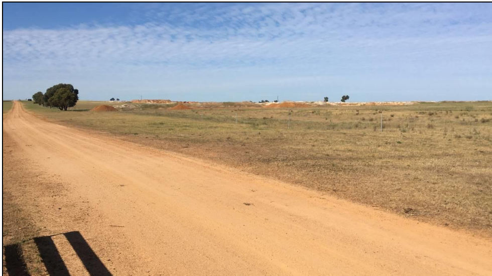
Figure 9.1.1(h) – View facing west along Skipper Road from eastern access point