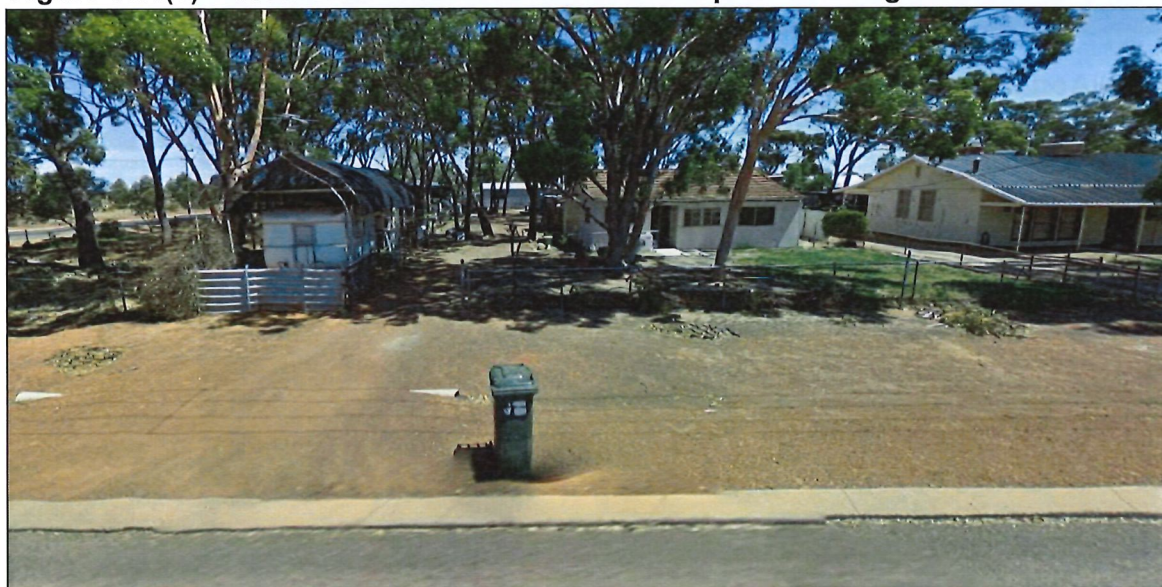
Figure 10.4(d) – View of Lot 186 from Carter Street following siting of sea container