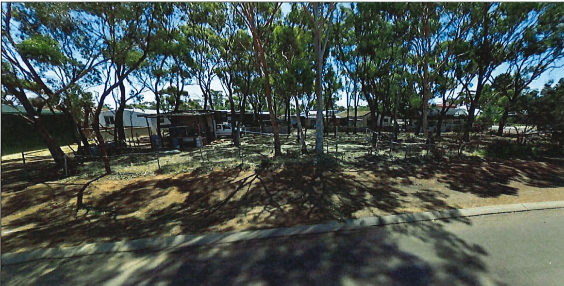
Figure 10.4(f) – View of Lot 186 from Water Street following siting of sea container